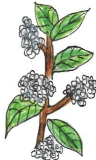
NEW JERSEY TEA