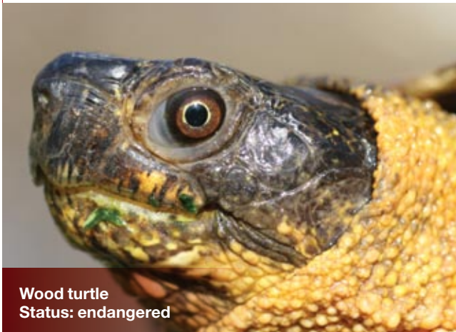
Wood turtle Status: endangered