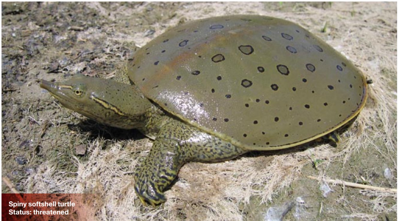
Spiny softshell turtle Status: threatened

snake's back as Crowley points out its mottled colouration and patterning. In three hours of tromping around Kinghurst, Crowley will show me ribbonsnakes, red-bellied snakes and gartersnakes galore.