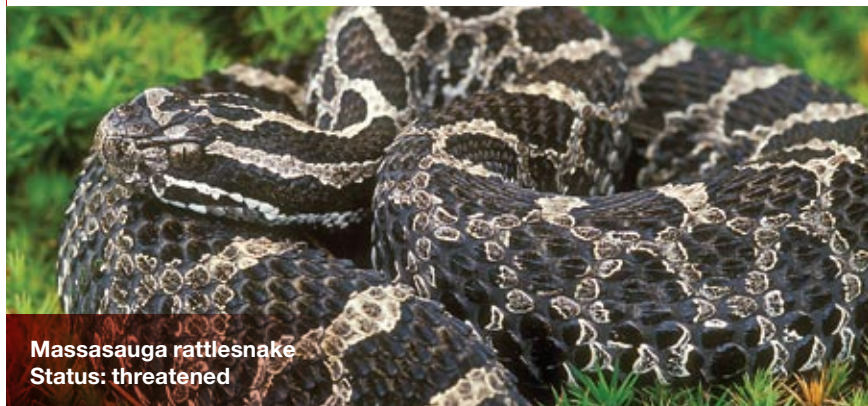
Massasauga rattlesnake Status: threatened