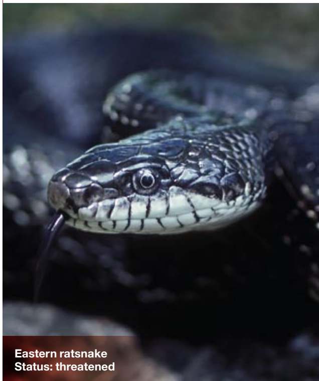
Eastern ratsnake Status: threatened