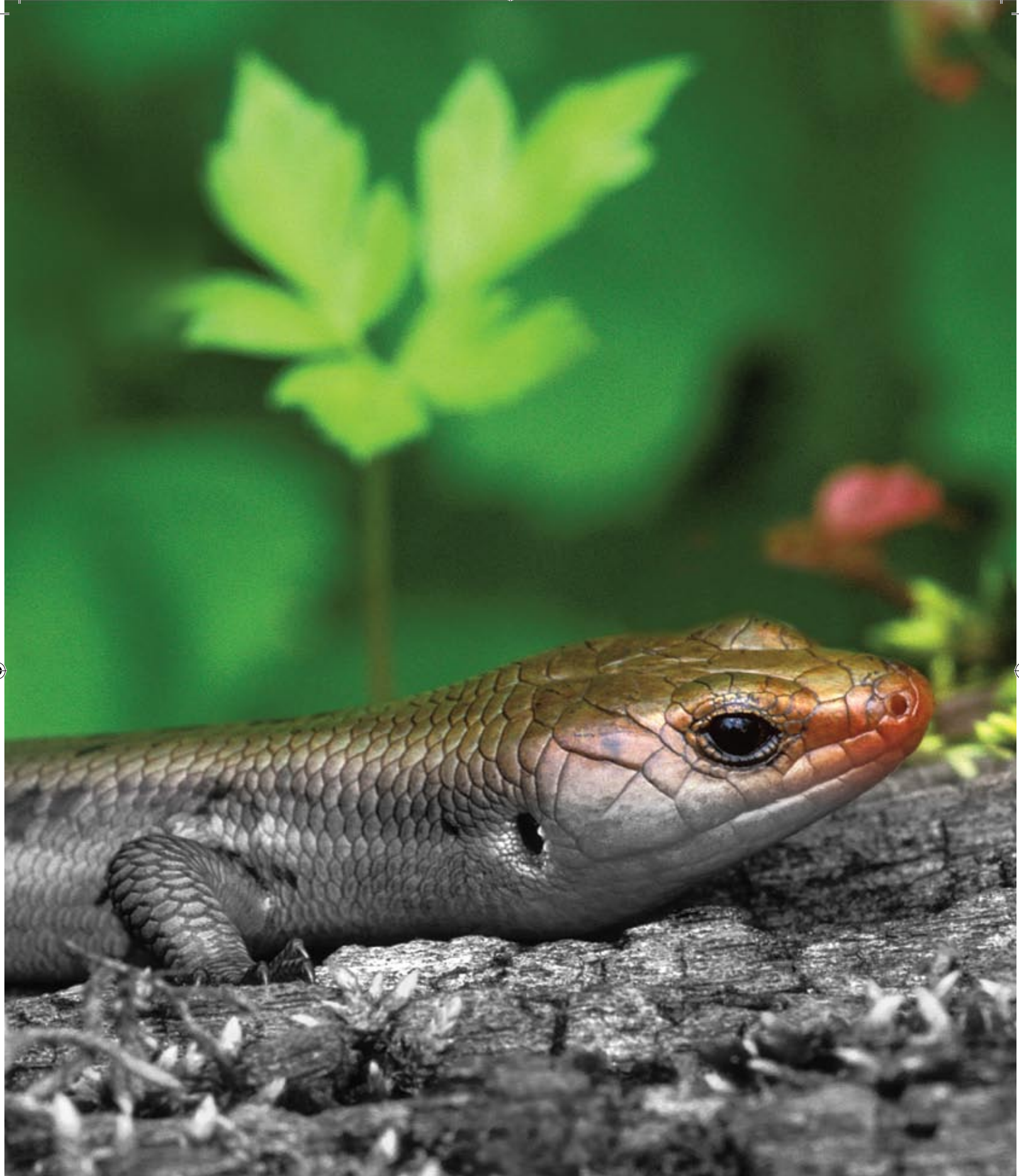
Five-lined skink Status: special concern