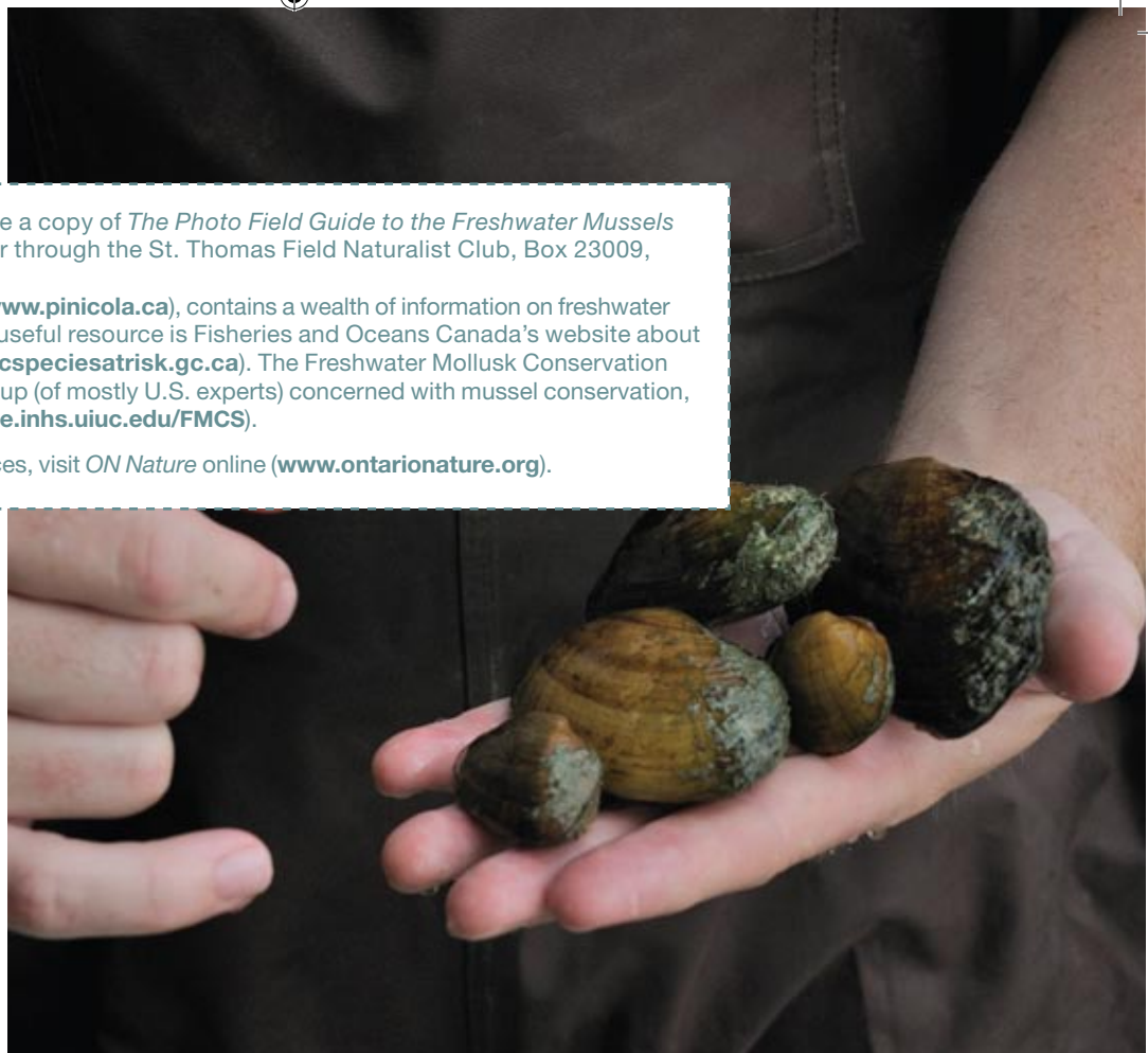
Biologist Todd Morris shows off mussels scooped from the bottom of the Grand River in Kitchener; the endangered wavy-rayed lamp-mussel is second from the right

For a more complete list of resources, visit ON Nature online ( www.ontarionature.org ).