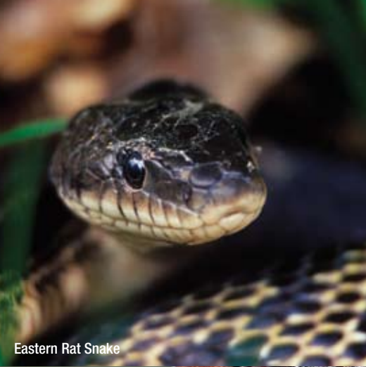
Eastern Rat Snake