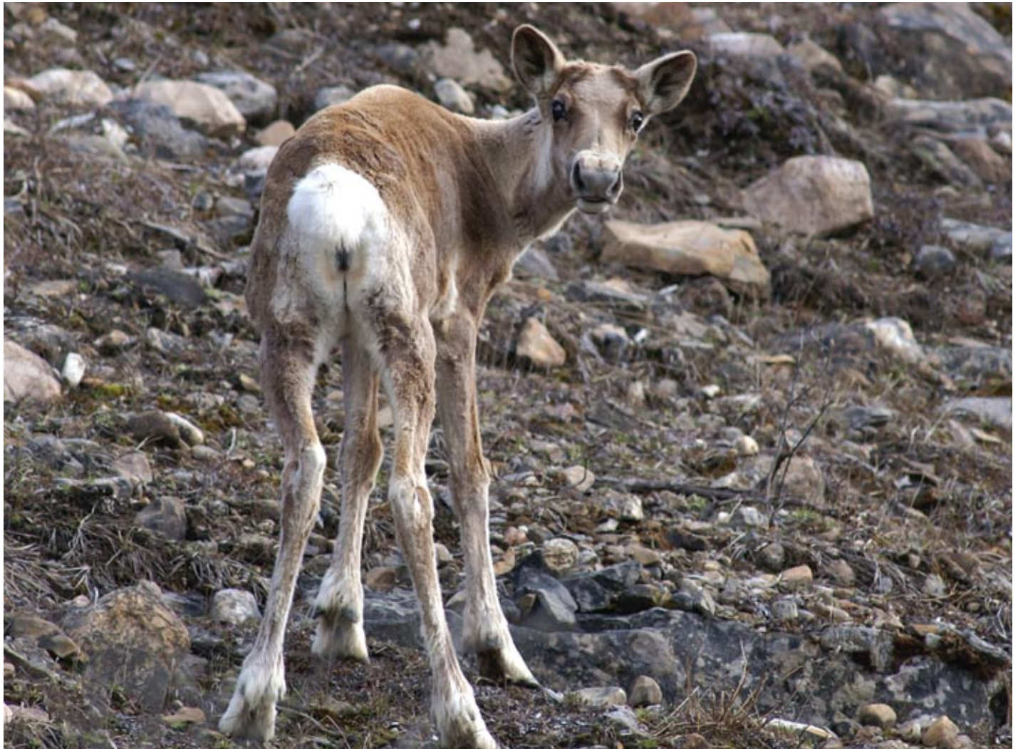
Slow reproductive rates make woodland caribou especially vulnerable to population declines

let alone study. Before calving, the females hole up in bogs or on islands, in densities as sparse as one cow per 20 square kilometres – the equivalent of just 32 caribou in an area the size of Toronto.