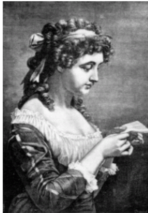
Canadian Illustrated News , Vol. XI, No.4, Page 61. Reprinted from the National Library of Canada's website Images in the News: Canadian Illustrated News .

Be specific about what you want done, and be prepared to wait at least a few weeks, and in some cases months, for a response.