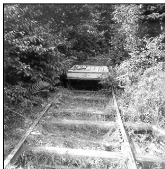
Figure 3: Cultural landscape features are generally found above ground such as this marine railway near Chapleau, Ontario.