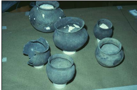
Figure 4: Aboriginal values sites not only include those where artifacts but also traditional spiritual and ritual areas.

The Forest Management Planning Manual (FMPM) outlines the process planning teams use to identify Aboriginal values. The planning team and other involved MNR staff will work in collaboration with participating Aboriginal communities to ensure that the objectives, scope, methodology and end use for data collected are agreed upon and documented. Methods used in gathering and collecting data should be sensitive to the Aboriginal community's input. In many cases, Aboriginal communities do not have the available human or financial resources to identify and manage the values data collection. It is also vital that the planning team recognize the importance of working with communities to obtain the best possible data from the correct source.