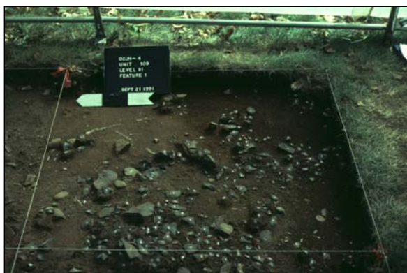
Figure 2: Archaeological sites generally have artifacts found only in the soil.

Regulations to the Ontario Heritage Act define archaeological sites as: